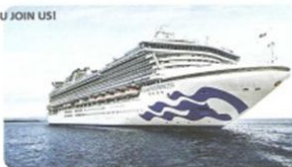
Illustration of price is created and distributed by an independent travel agency, not by Princess. ©2024 Princess Cruise Lines, Ltd. Ships of Denmark and British registry.