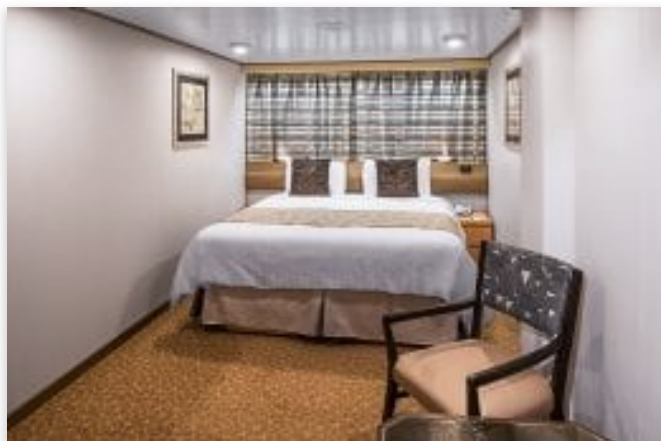
INSIDE FROM $1,889

Please select your stateroom or suite type and room category from the available options.