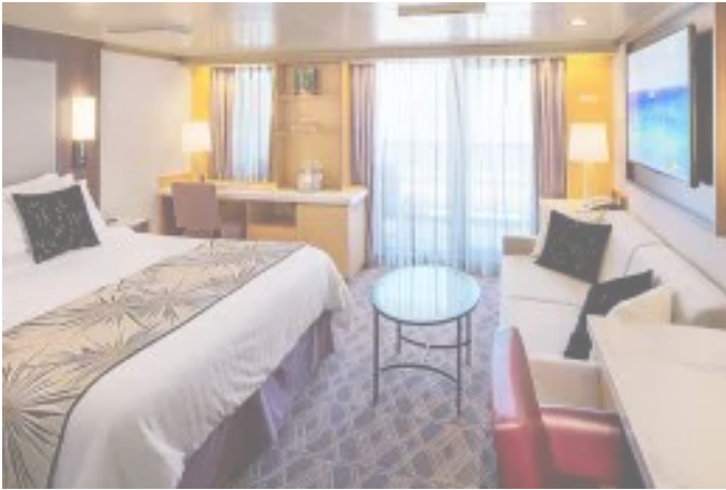
SIGNATURE SUITE FROM $3,439