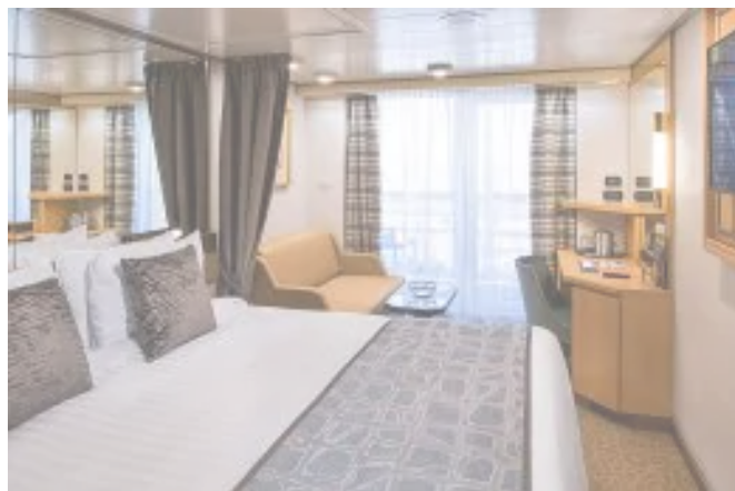
VERANDAH FROM $2,689