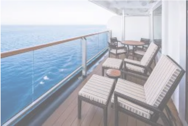
NEPTUNE SUITE FROM $4,959